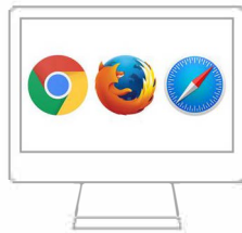
PC and Mac Chrome | Firefox | Safari

1 Use a computer or device with camera/microphone